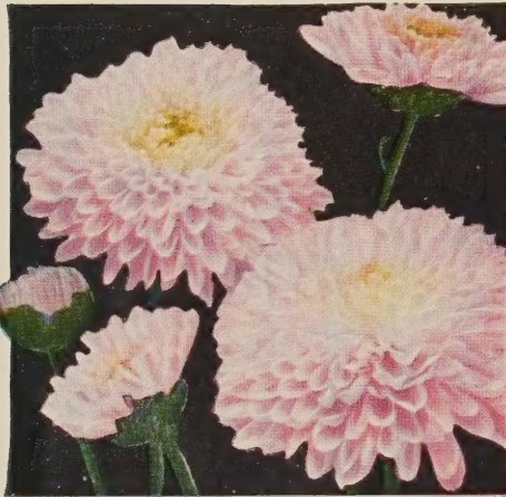
EARLY WONDER. 50c each; 3 for $1.25